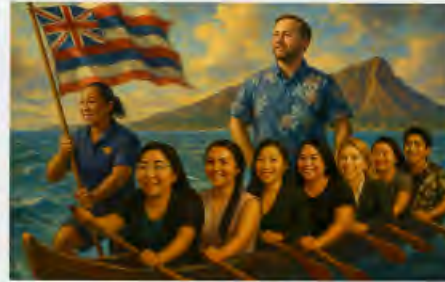
"NEW HORIZONS" SUMMER 2025