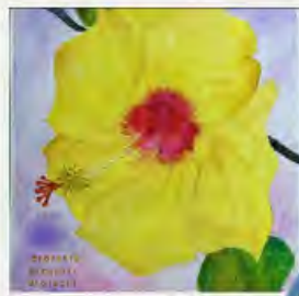
"MĀO HAU HELE" FALL 2025