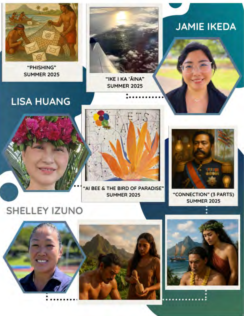
"PHISHING" SUMMER 2025