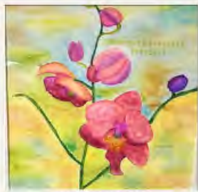
"ALOHA KĀUA" SUMMER 2025