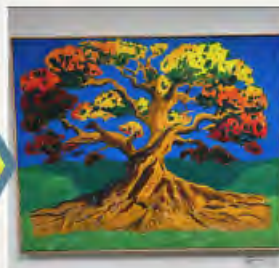
"ROOTED CONNECTION" SUMMER 2025