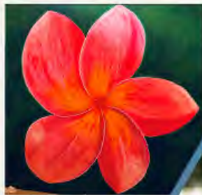
"ALOHA BLOSSOMS" FALL 2025