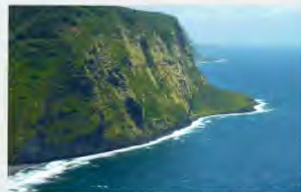
"BIG ISLAND WAIPI'O VALLEY LOOKOUT" FALL 2025