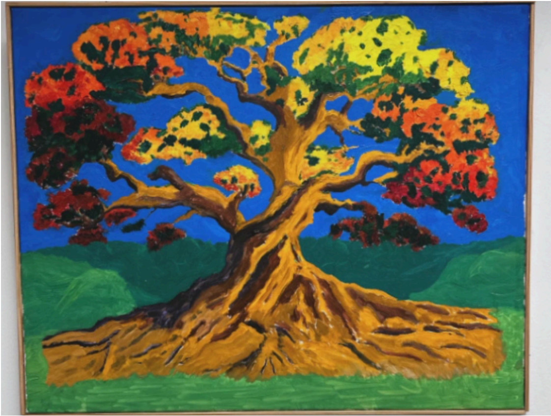
"Shaved Ice Banyon" by Joe Pierce