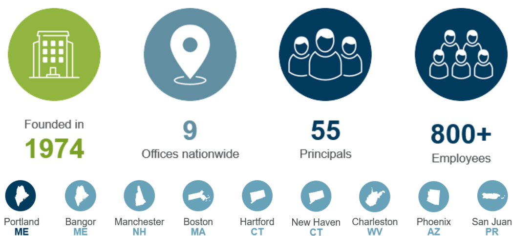
Figure 4-1: BerryDunn Overview

BerryDunn regularly performs audits of IT and business organizations and their processes, as well as the interactions they have with other agencies and departments. Independent audits and project assessments are core to our consulting practice, and our project teams have conducted enterprise-wide strategic risk assessments, project audits, and project health assessments for public-sector clients for more than 33 years.